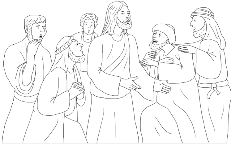
Jesus' disciples wanted to be powerful, he wanted them to serve others.

For Jesus, being the greatest means putting the needs of others before our own.